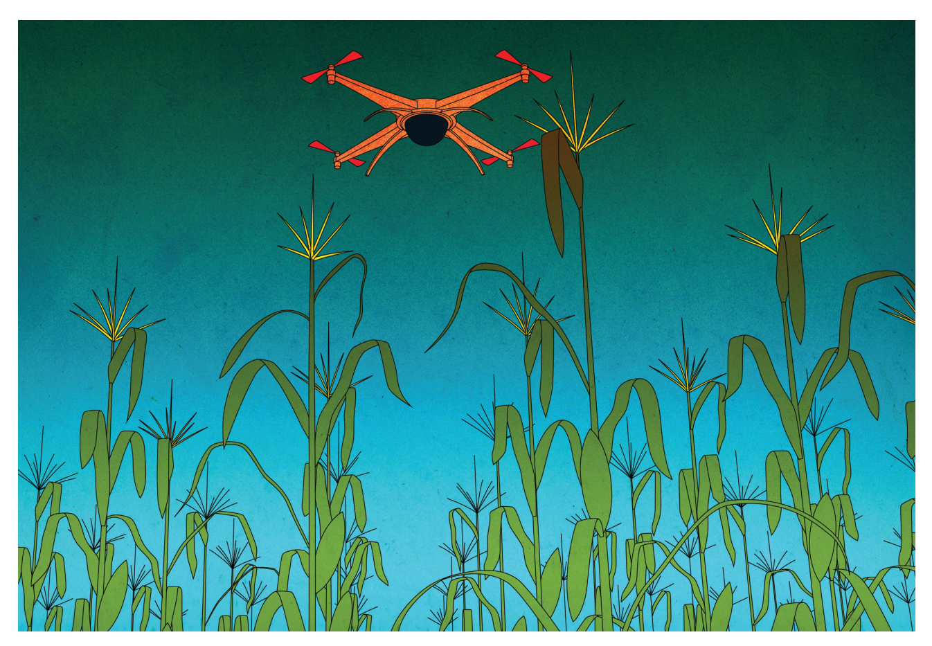
34 Scientific American, December 2017

In a related development, seed producers are applying technology to improve plant "phenotyping." By following individual plants over time and analyzing which ones flourish in different conditions, companies can correlate the plants' response to their environ-